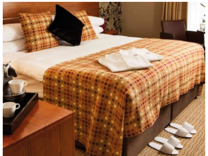
This image represents one of our Privilege rooms. Why not upgrade to a Privilege room?